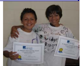
New Bridge Students

The economic climate doesn't change what kids need to grow and thrive. Boom or bust, kids need a safe and challenging environment during the summer to make sure they don't lose vital academic ground. Peninsula Bridge understands our program is more critical now than ever, and we were thrilled to open a new program site (our second in as many years) at St. Matthew's Episcopal in San Mateo this past summer. Our expansion enabled us to support 30 additional students (rising 5th and 6th graders) from the San Mateo-Foster City School District.