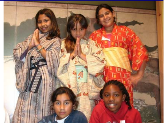
Castilleja students at the Asian Art Museum